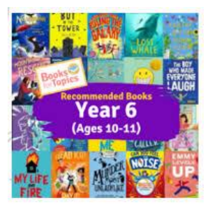
Year 6: 50 Recommended Reads